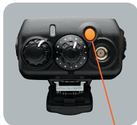
Dedicated Programmable Emergency Button

Industrial and commercial workplace safety programs require emergency preparedness when accidents or hazardous situations arise. This includes a plan to alert help instantly. The Emergency alert function is programmed by your Dealer and is designated to transmit an emergency notice on a specified channel. With a press of a button, the radio transmits an emergency alert to call for help or to notify others to implement the emergency action plan.